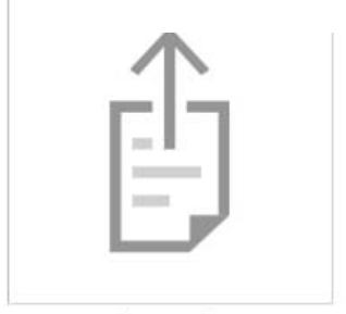
Import zip Create a template by uploading a zip file with your template code.