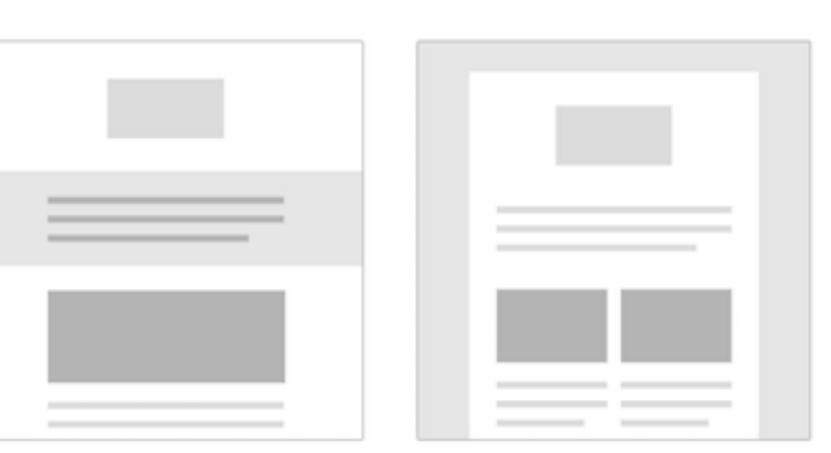
1 Column - Full Width